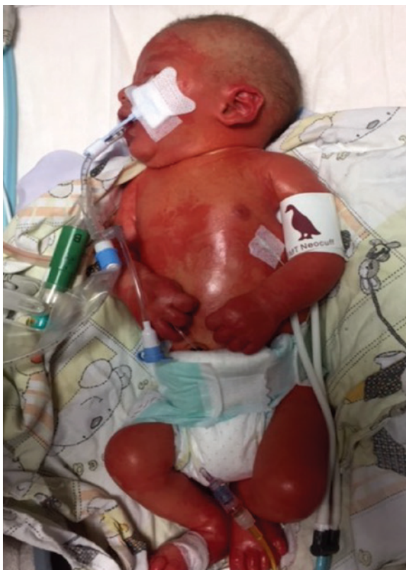
FIGURE 1. The patient with fine scalp hair and erythroderma

Macknet et al. reported an infant with NS who received ECMO treatment for persistent pulmonary hypertension that was speculated to be secondary to bronchopneumonia due to thick amniotic fluid containing exfoliated epidermal cells. 4 Our patient was intubated, received surfactant shortly after birth, and referred to our unit for ECMO treatment. Due to mild pulmonary hypertension the infant was treated with conventional therapies. We thought that aspiration of the amniotic fluid containing desquamated epidermal cells caused pneumonia and respiratory insufficiency.